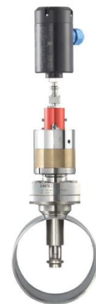
Figure 2: Sensor installed in sensor retraction tool

Most of the plants are small sized and unmanned or are even located at offshore platforms. A regular sensor exchange or extensive maintenance must be avoided to keep the operational cost as low as possible. And in case of yearly check, the installation of the sensor with a sensor retraction armature makes maintenance easy, quick and without process interruption.