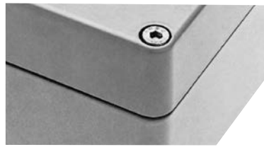
Socket-head cap screws

On request, BARTEC supplies all enclosures complete with terminals, cable entries, blanking plugs and other fittings and components.