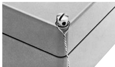
Sealable steel lid screws