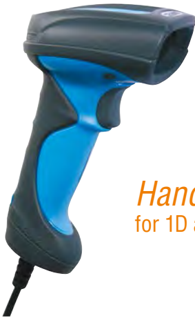
Hand-held scanner BCS 160 ex for 1D and PDF barcodes