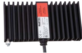
HSF 50/HSF 100