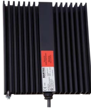
HSF 120/HSF 200