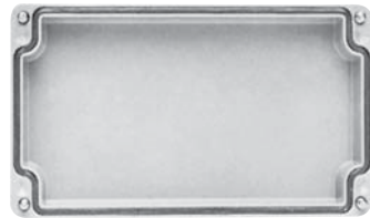
Lid seal Material: silicone temperature resistance: -55 °C to +100 °C