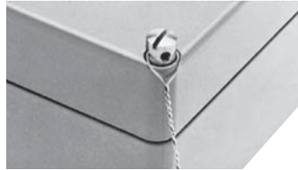
Sealable steel lid screws