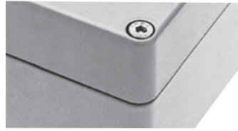
Socket-head cap screws